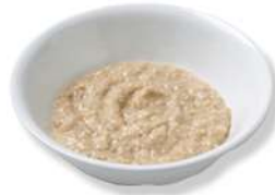
1/2 cup of oatmeal