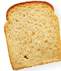
1 slice bread