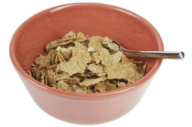
1 cup of cereal

How many servings of whole grain would you get, if you ate each of the foods below?