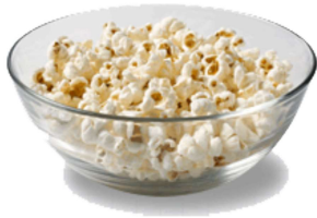
3 cups of popcorn

Each of these equals one MyPlate serving of whole grain.