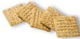
5 whole wheat crackers