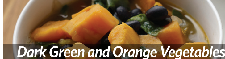
Dark Green and Orange Vegetables