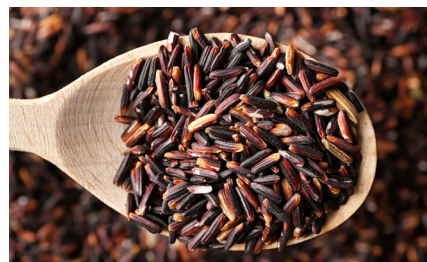
Wild Rice (Sprouted, Puffed, Flour)

Wild rice is an aquatic grass that grows in the waterways of North America. It can be prepared like white or brown rice. Wild rice has a nutty, earthy flavor.