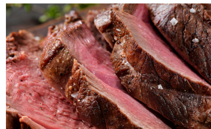
Whole Cuts Venison (Elk or Deer)

Venison is a lean meat from native deer or elk. It can be used in place of other red meats in recipes, as it has a flavor similar to beef, but richer and earthier.